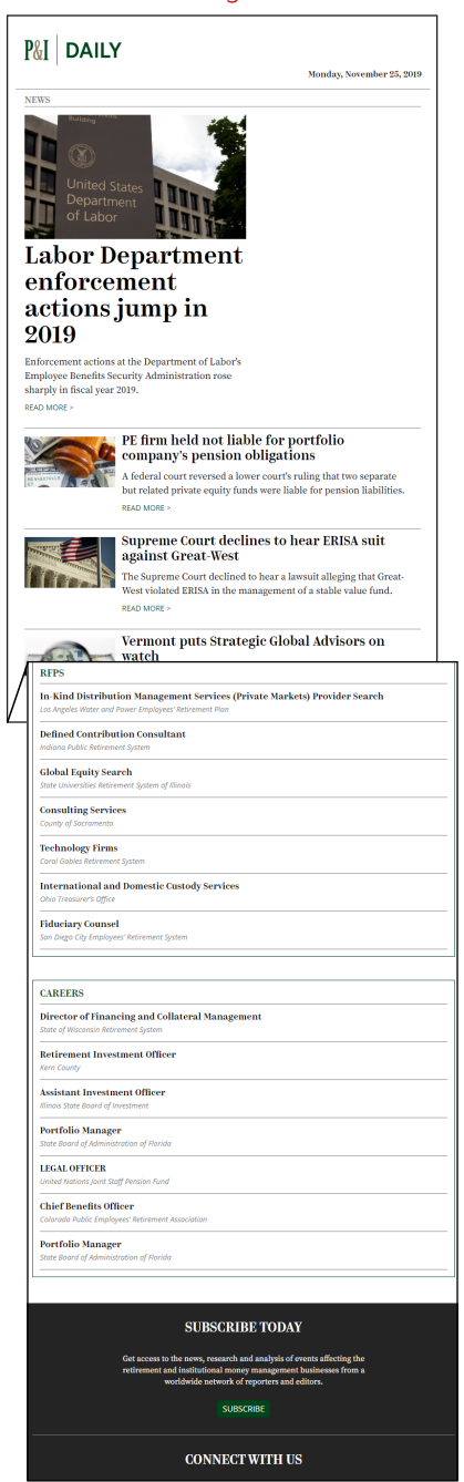
Option 1 and 2