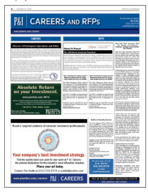
Option 1 only